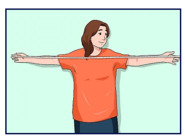
2. arm span